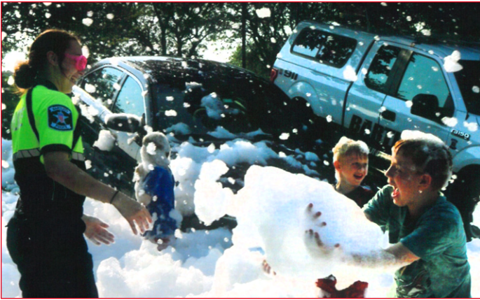
Bartlett (IL) Police brought out the suds machine for this year's National Night Out.