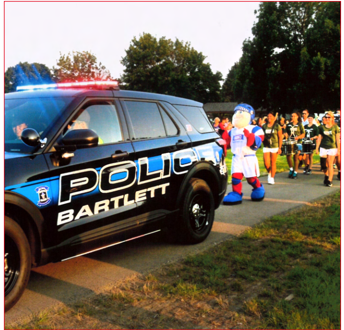
Bartlett (IL) PD and Nat the Knight leading the troops at National Night Out 2025.