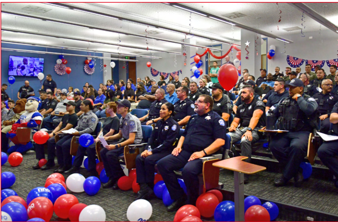
Coordinators in Modesto (CA) meet before National Night Out 2025.