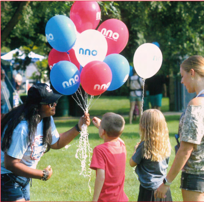
Another amazing NNO event in Bartlett (IL) this year.