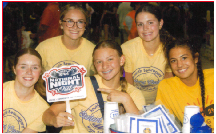
Student Council at the fingerprint booth during the National Night Out in DeRidder (LA).