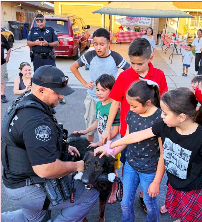
Modesto (CA) police and K-9 made sure all of the children were included in NNO 2025.