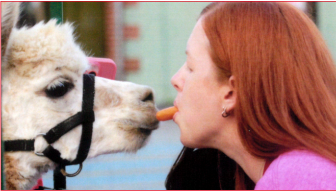
Alpacas of Windy Haven Farm were featured at NNO in Moscow Borough (PA).