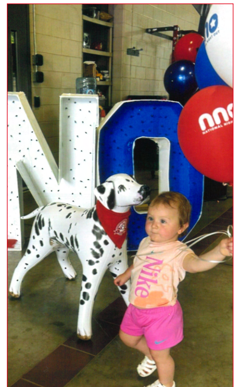
Sometimes it's best to just let the photo do the talking. Welcome to the The Woodlands (TX).

If your community has not registered yet, please visit natw.org/dog . Ideally, you want your local police or sheriff's department to register as they will be doing the training. A training presentation is available for local law enforcement agencies.