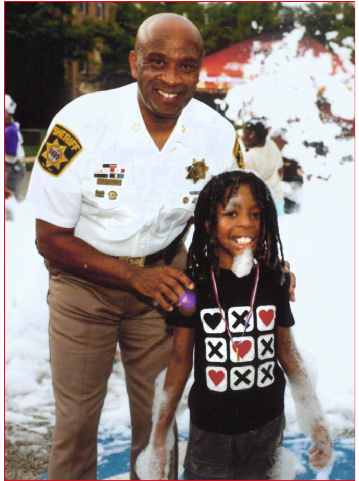
The children had a ball at National Night Out in Charles County (MD).