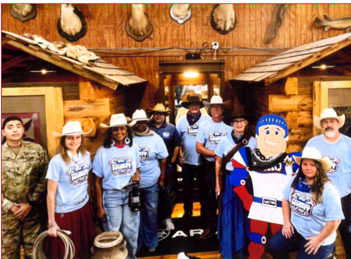
Presenting the National Night Out 2025 Planning Committee in DeRidder (LA).