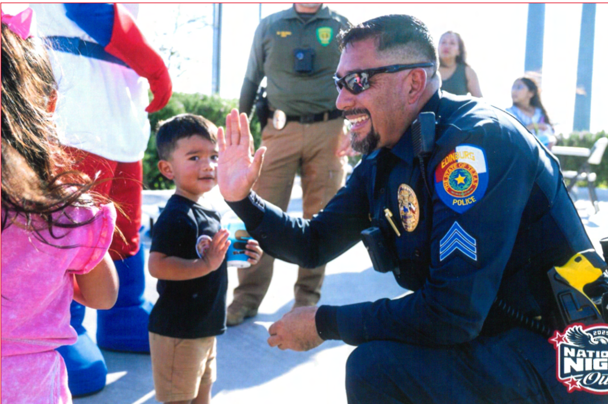
It was all about the kids this year during National Night Out in Edinburg (TX).