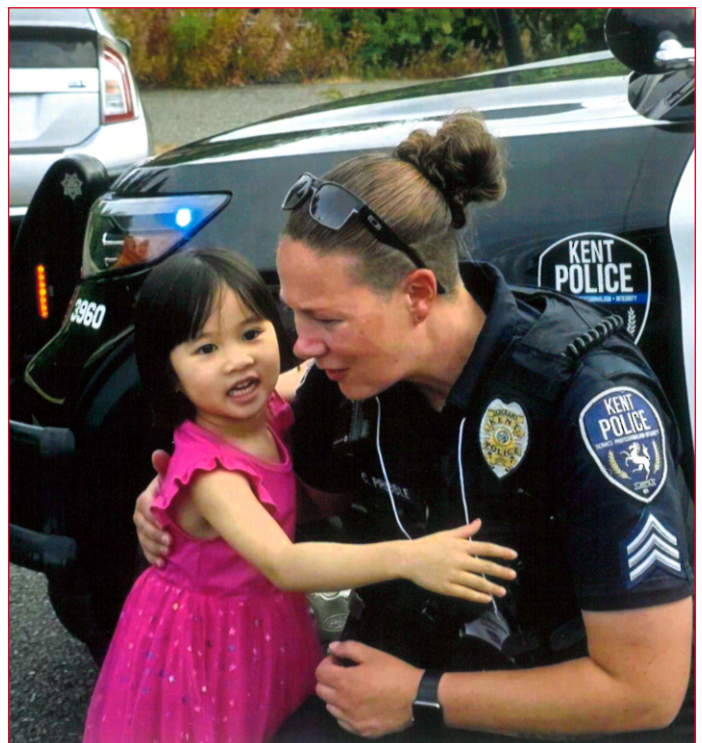
This is another one where we let the photo do the talking in Kent (WA).