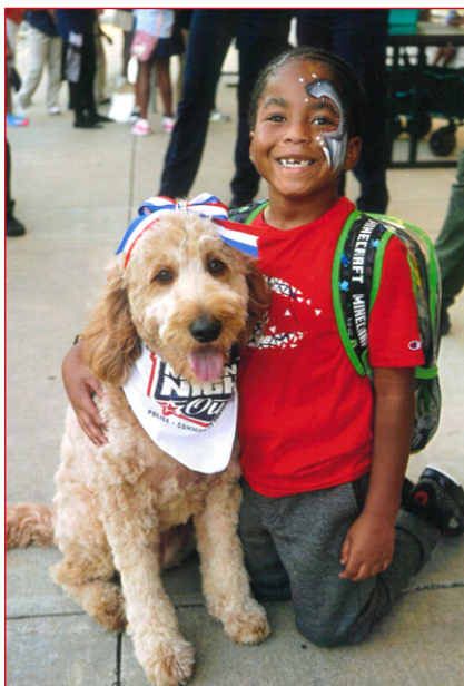
Another outstanding National Night Out in Grand Prairie (TX).