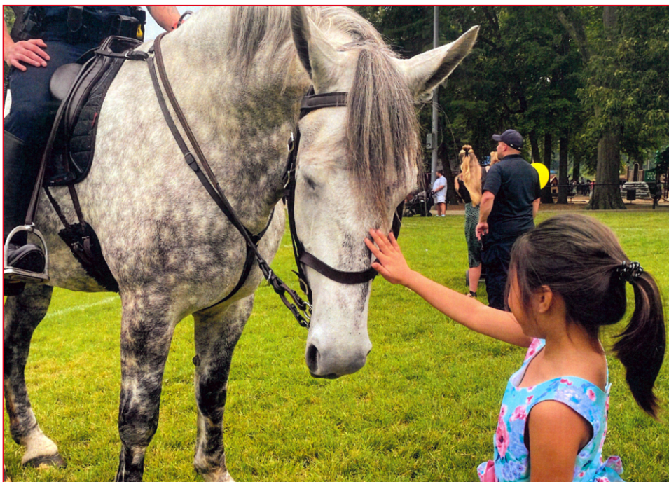
The Mounted Unit brought smiles during National Night Out in Bowie (MD).

He added, “A big thank you to our awesome corporate partners who help us do what we do year in and year out. Their support and leadership make the NNO engine run and we thank them for standing