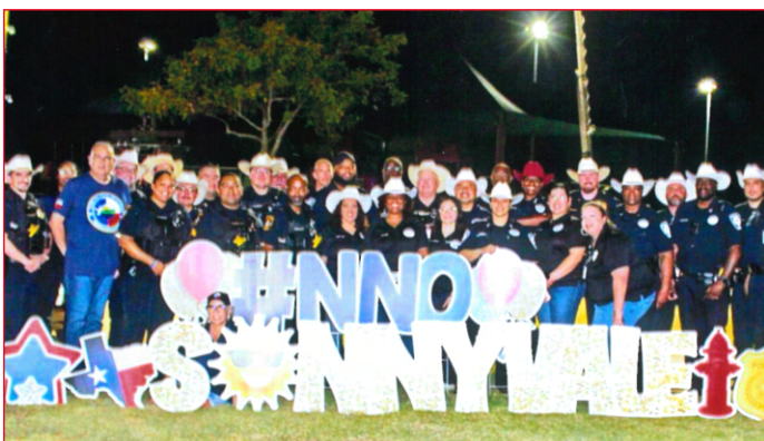
A powerful National Night Out team in Sunnyvale (TX) this year.