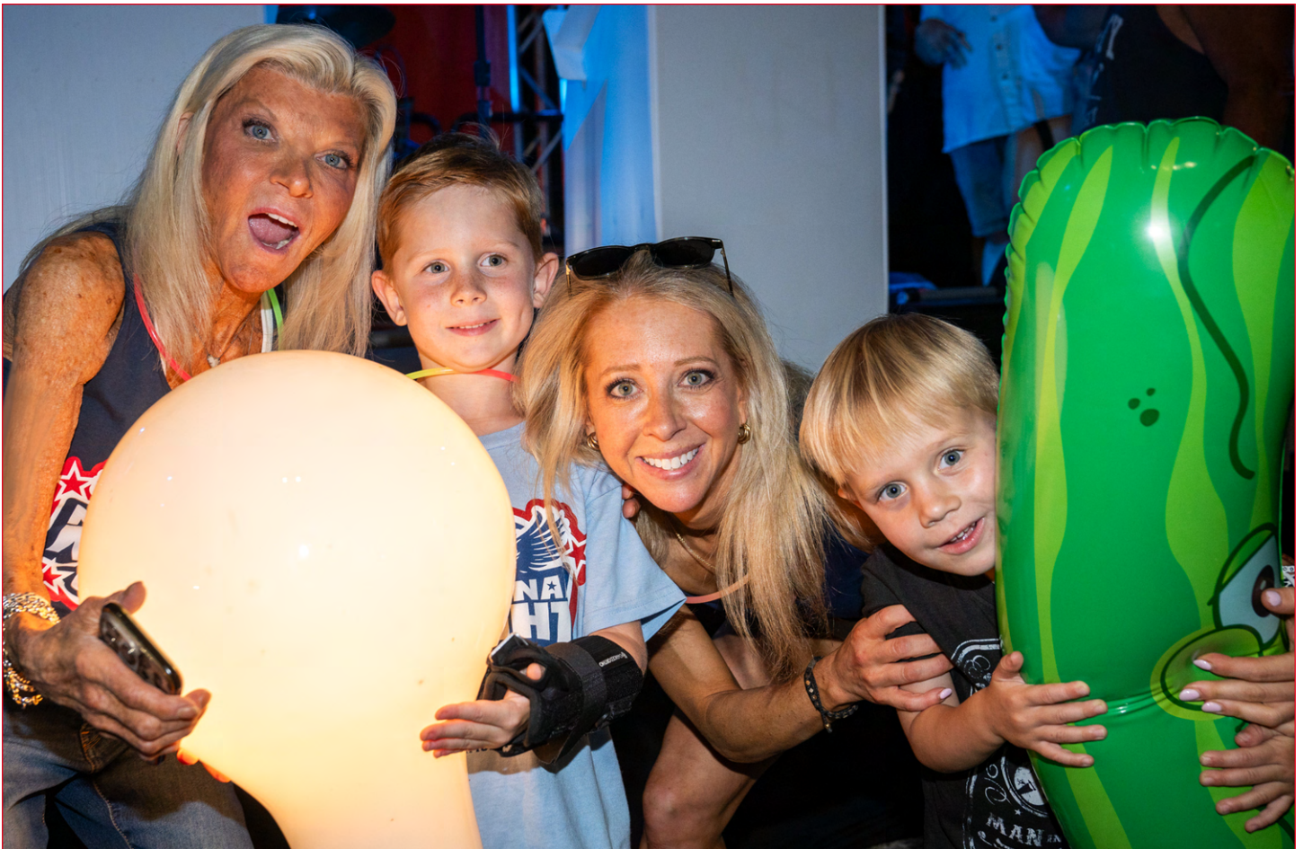
Residents in Lower Merion Township (PA) gathered for another highly successful National Night Out with over 2,000 residents attending.