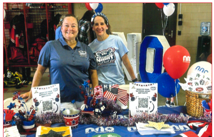
Registering your National Night Out 2025 party in The Woodlands (TX).