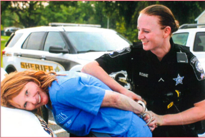
Fauquier County (VA) Sheriff's Department having some fun at NNO 2025.