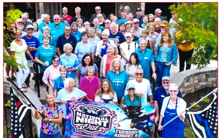
You could feel the unity this year during National Night Out in Hanover County (VA).