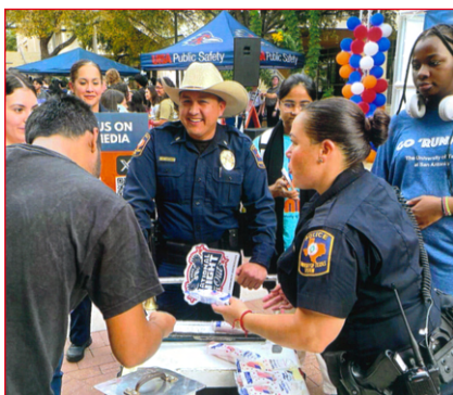
A great time at UTSA coordinated by the University of Texas at San Antonio Police Department.

Submissions: NATW encourages readers to submit news items and will consider all articles, photographs and manuscripts. Material may be edited at the Association's discretion.