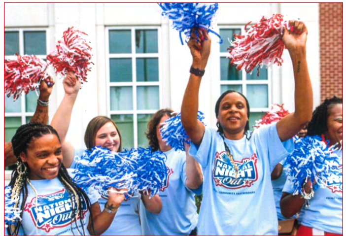
City employees form a cheer squad to send off Suffolk's (VA) 9 public safety-led NNO tours