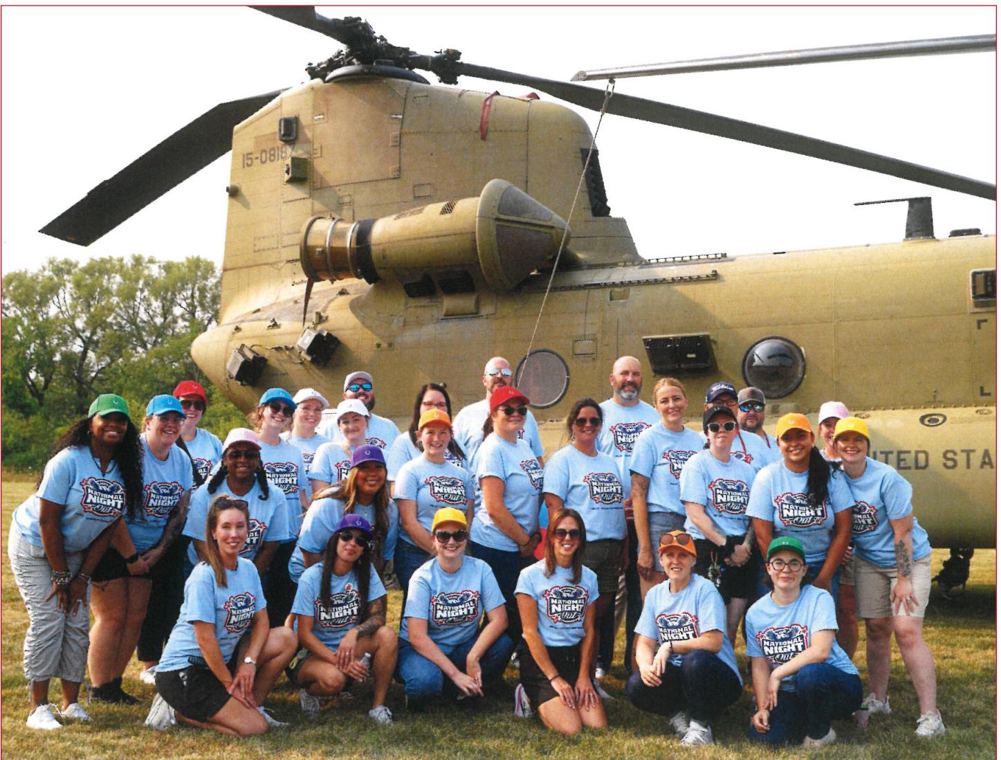
Fort Drum (NY) Mountain Homes employees gather in front of a helicopter to promote NNO 2025.