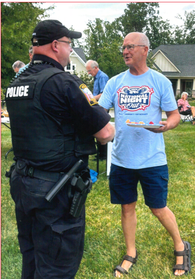
Such as here in Chesterfield County (VA), it's conversations like this that make NNO so special.