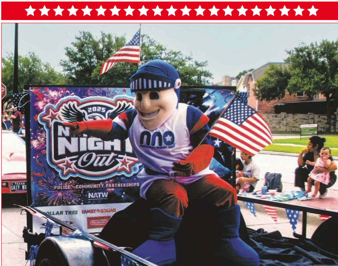
Nat the Knight was featured in the parade to promote this year's National Night Out in Coppell (TX).