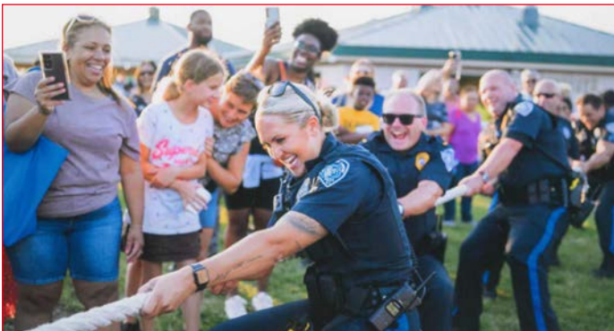
NNO Tug-of-War in South Brunswick Township, NJ.