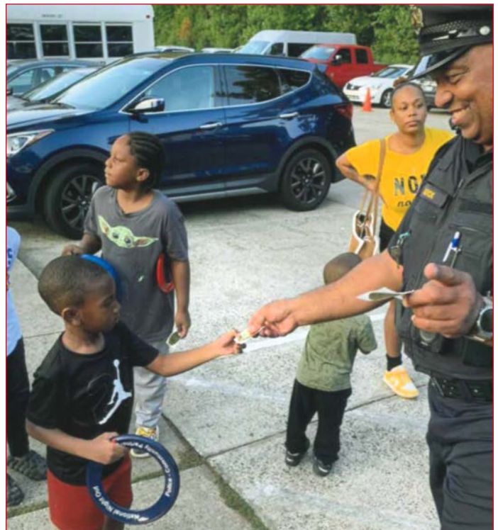
The Boys & Girls Clubs of Central Carolina are long-time partners with NNO in Sanford, NC.