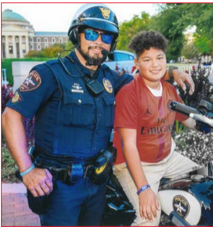
National Night Out 2023 at SMU in Dallas, TX.