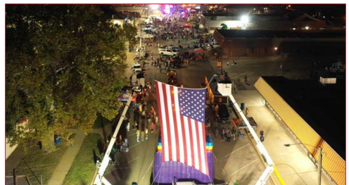
It was a beautiful night during NNO in Portsmouth, VA.