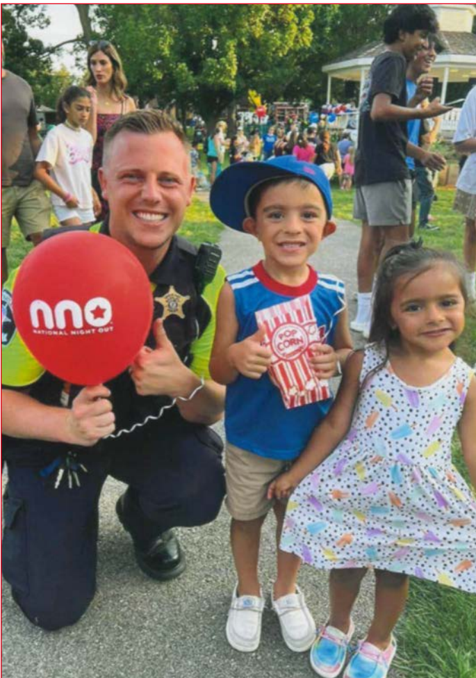
Smiling faces throughout the Village in Bartlett, IL, during National Night Out 2023.