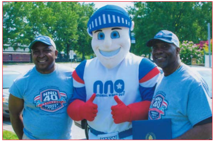
It was a beautiful night during NNO in Portsmouth, VA.