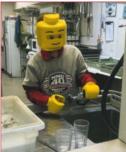
Washing away crime during NNO 2024 in Chino Valley, AZ.

Submissions: NATW encourages readers to submit news items and will consider all articles, photographs and manuscripts. Material may be edited at the Association's discretion.