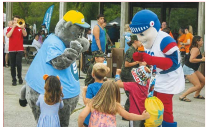
Blue the Hippo and Nat the Knight dancing with the kids at NNO in Oak Creek, WI.