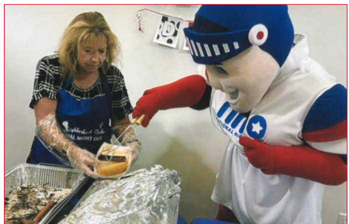
Nat the Knight dishing out hot dogs at National Night Out in The Woodlands, TX.