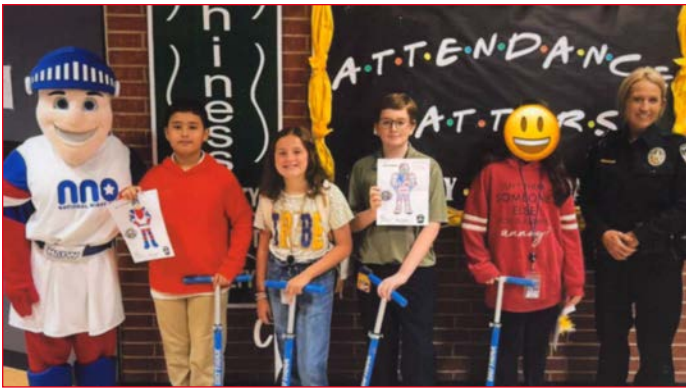
Scooters for the winners of the NNO Coloring Contest in Jacksonville, TX.