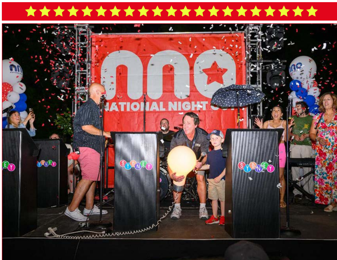
The grand finale at National Night Out 2023 in Lower Merion Township, PA.