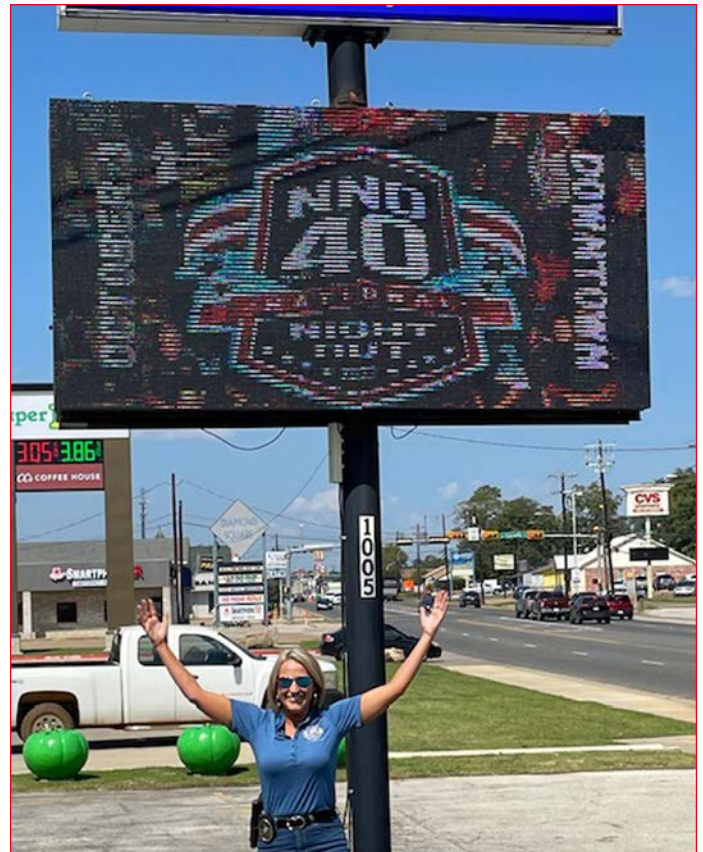
A Sign of the Times at NNO 2023 in Jacksonville TX.