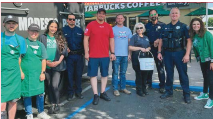
Modesto, CA, police and a local Starbucks collecting donations for National Night Out 2023.