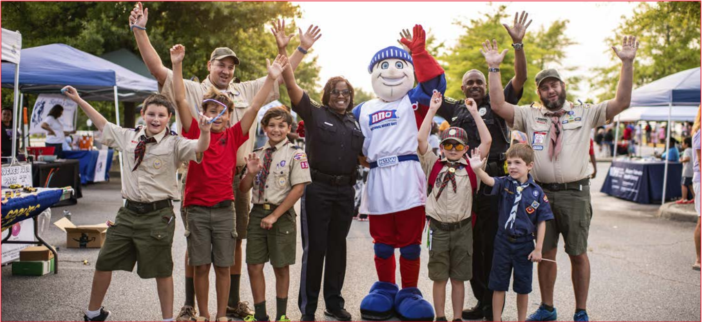
Nat the Knight and friends gather at another great NNO in Suffolk, VA.