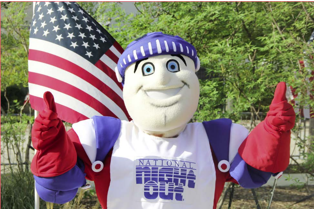
Nat the Knight welcomes residents to National Night Out 2023 in Arlington, TX.