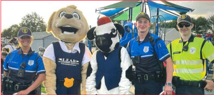
L.E.A.D. joined officers and residents at another great NNO in Gloucester Township, NJ.