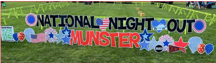
Munster, IN, always promotes National Night Out in a big way.

Dog Walker Watch (DWW), a crime awareness program created by the National Association of Town Watch (NATW) is growing rapidly across the country. There are over 75 million dog walkers throughout the USA. DWW training classes, conducted by local law enforcement, teach citizens how to become more effective observers and reporters of suspicious activity.