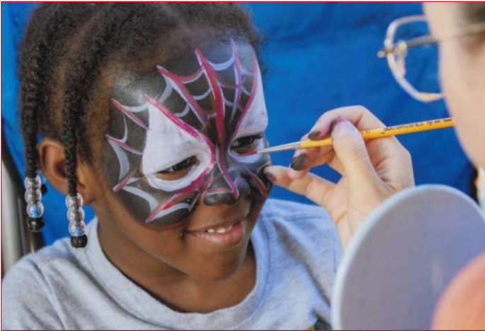
Fun for all ages at National Night Out in Louisville, KY.