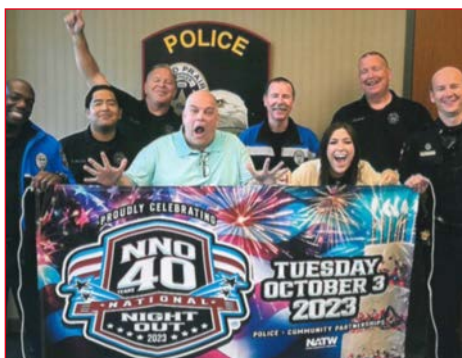
It looks like they were ready for NNO this year in Grand Prairie, TX.

worldwide joined forces to celebrate the 40th Annual National Night Out (NNO)—a community crime prevention and safety event sponsored by the National Association of Town Watch in partnership with ADT, Starbucks, Associa and L.E.A.D.