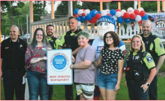
Officers salute the Most Spirited NNO Block Party in Bartlett, IL.