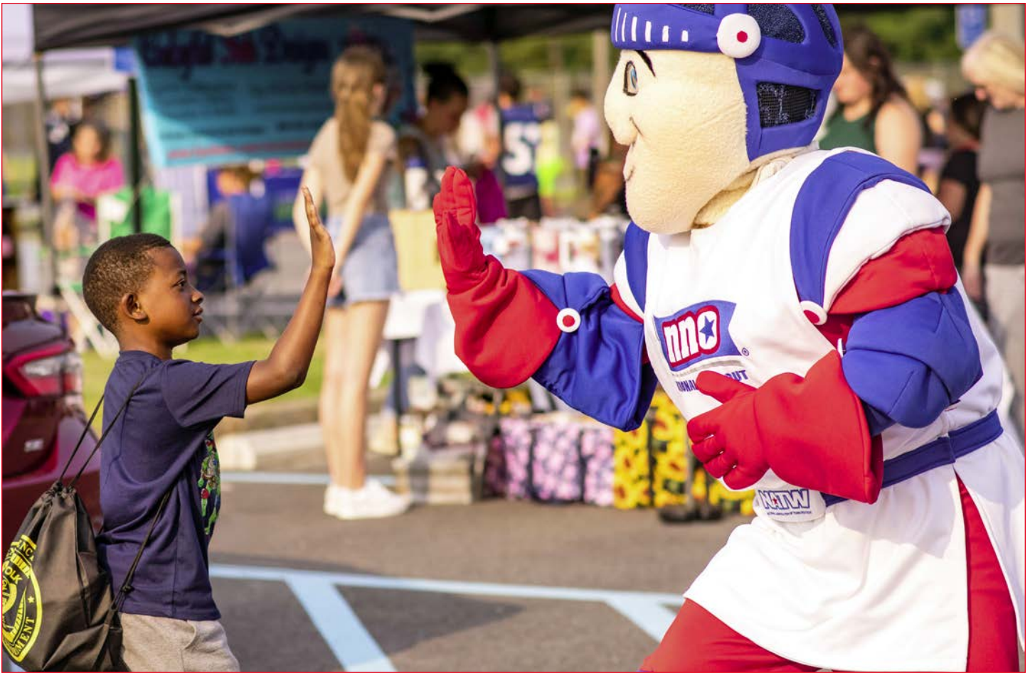
High fives all night long during National Night Out 2023 in Suffolk, VA.