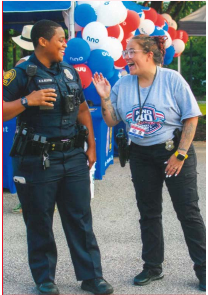
A great time during NNO this year in Portsmouth, VA.