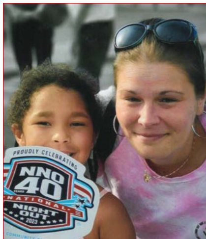
A great NNO this year in Cape Girardeau, MO.