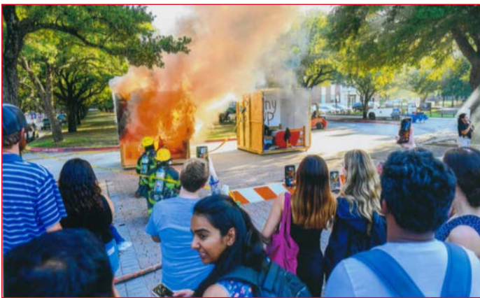
University Park Fire Department at Southern Methodist University demonstrate the dangers of fire in residential halls. Two replica student rooms: One with fire suppression vs. one without.